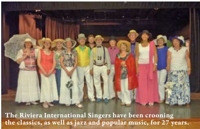
The Riviera International Singers have been crooning the classics, as well as jazz and popular music, for 27 years.

stressed this is more to ensure they are singing with the voice group that's best for them.